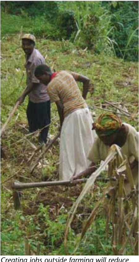
Creating jobs outside farming will reduce

Land is critical to the country's socioeconomic and political development.