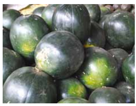
Water melons in a market stall

Aphids can be controlled with preparations from the Neem tree, Tephrosia leaves, pyrethrum flowers, chilies, garlic, and soap. These preparations can also control spider mites and thrips